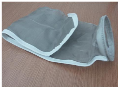
Stainless Steel filter bag