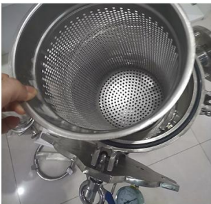
Stainless Steel mesh basket