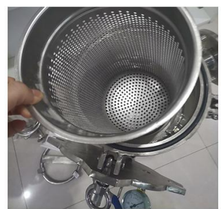
Stainless Steel mesh basket