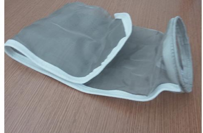
Stainless Steel filter bag