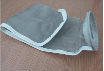
Stainless Steel filter bag