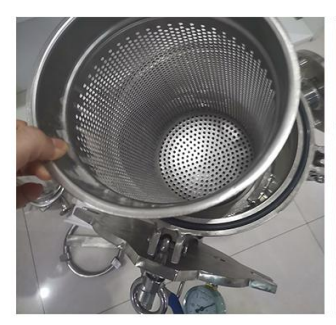
Stainless Steel mesh basket