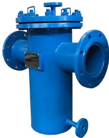
Carbon steel basket filter, surface painting Flange connection type top lid