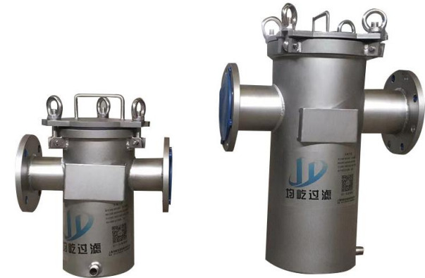
SS basket filter, surface sandblasting Eye bolt connection type top lid