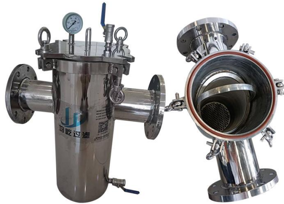
SS basket filter, surface mirror-polishing Eye bolt connection type top lid