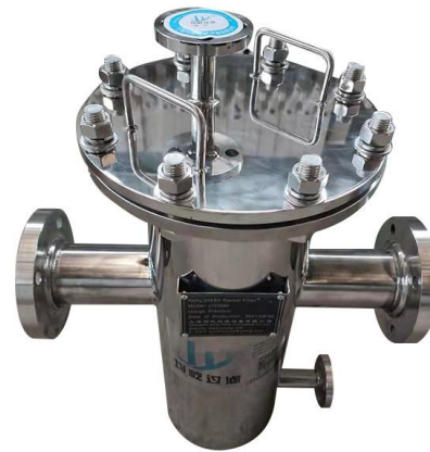
SS basket filter, surface mirror-polishing Flange connection type top lid