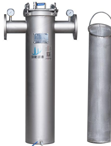
Customized basket filters